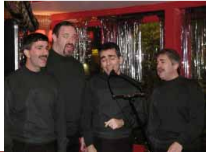
Mercury, the home quartet that performed on our Fall show, singing at the After-glow.