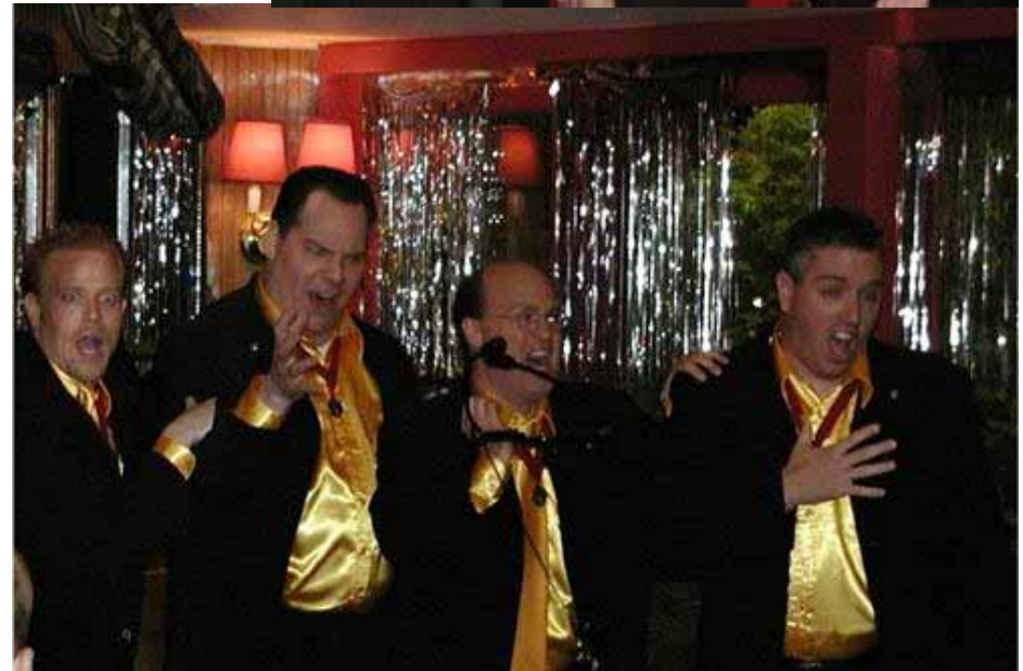
Our fabulous and zany guest quartet, Metropolis, wowing us at the Afterglow as they did the audience at the shows.