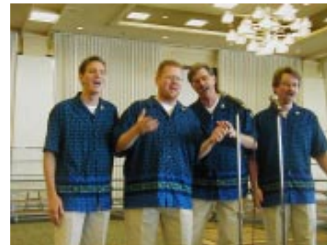
Phat Cats at Pep Rally in Portland.

Later that evening we all gathered for the annual Togetherness Dinner. This year there was no keynote speaker! However, a representative