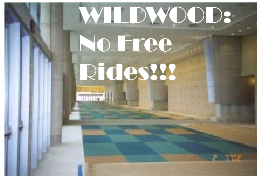
The new convention center at Wildwood NJ, site of the upcoming District Contest.