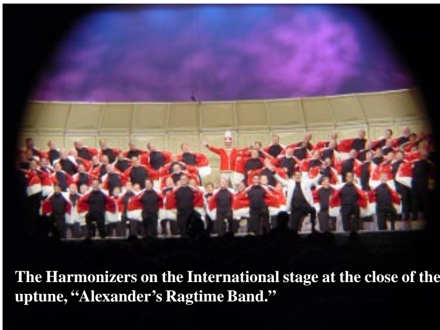
The Harmonizers on the International stage at the close of the uptune, "Alexander's Ragtime Band."